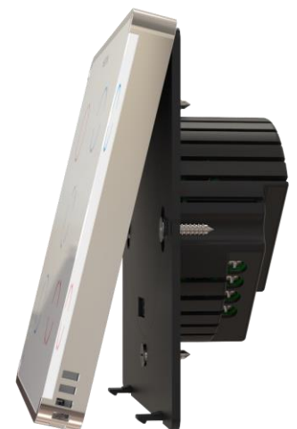
Figure 3: Install Touch Panel Unit

Note: Zero-Cross technology is unavailable if the device operates using DC voltage (24-48VDC).